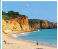
Porto de Mós